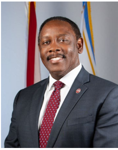
Orange County Mayor Jerry L. Demings